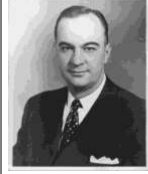
Gov Ed Arn

After US Senator Clyde Reed died in office on 1949, Henry Darby was appointed to finish the term and former Governor Frank Carlson was elected in 1950 as US Senator and went on to serve three complete terms, before retiring. US Senator Arthur Capper, having served five full terms was succeeded by former Governor Andrew Schoeppel who won the 1948 election and served two complete terms before dying in office during his third term. In the State House, of the 125 seats Republicans always held between 90 and 107 seats; in the State Senate, of the 40 seats, Republicans held between 34 and 39 seats.