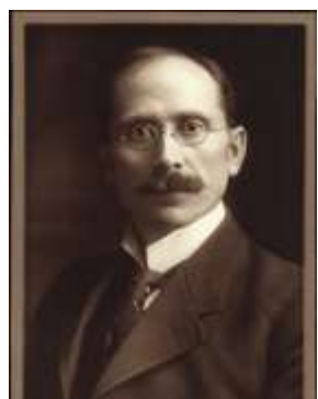
Sen. Joseph Bristow

Primary elections were adopted in a special