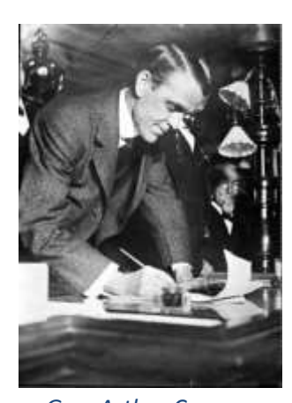
Gov. Arthur Capper

In 1914, most of the Progressive faction rejoined the Kansas Republican Party, although some, like Henry Allen, broke away and joined a new, separate "Progressive Party". As a result, in 1914 the Republicans regained control of the State House. In 1916, after the break-away progressives rejoined republican ranks, the Republicans regained control of the State Senate and won seven of eight Congressional seats.