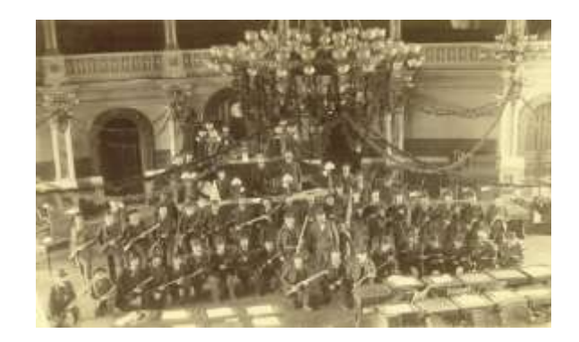
Armed members of the House

1892 Elections : In the 1892 election, the Republicans gained 39 House seats for a total of 65 seats, a bare majority; went from 38 Senate seats to 15; held only two of eight Congressional seats, lost the Governorship, and Kansas voted for the Populist candidate for President. The makeup of the House was disputed resulting in the "Populist War."